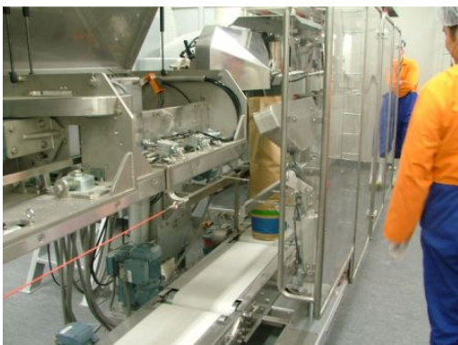
Left: 1 Aug 09 1st Bag being filled!