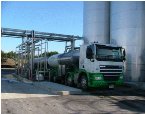
Left: 31 July 09 First Tanker arriving and unloading on site at Wanganui !

Thanks to all our Wanganui Suppliers for making this possible – from all of us at Open Country