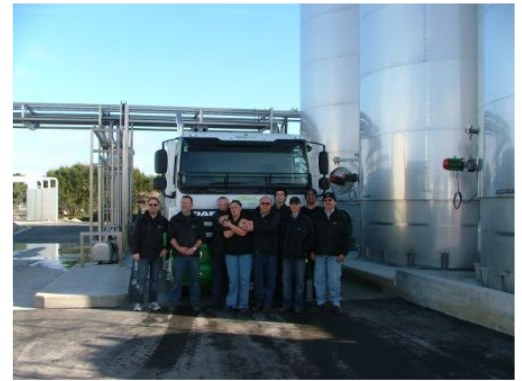
Right: 31 July 09 Open Country operators at first Tanker unloading - thanks for all your efforts!