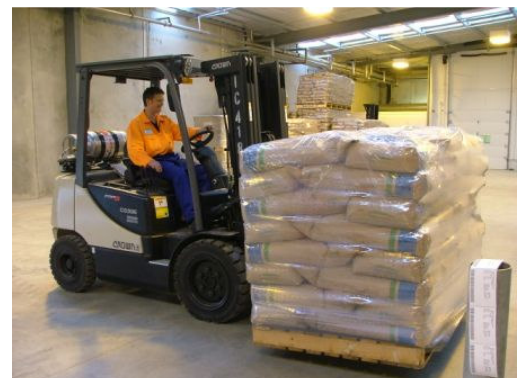
Right: 1 Aug 09 1st Pellet being fork-lifted into storage, ready for shipping.